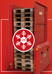
Pallet handling in cold environments down to -13 °F/ -25 °C (Only available for 15 pallet / 500 kg capacity models)