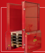
Safety frame with gate for 15 pallets