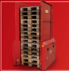
Safety frame for 15 pallets

The PALOMATs are built in 2 mm steel. Each unit includes safety frame, stop blocks, forklift protection, and a US plug.