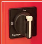
Main Isolation Switch