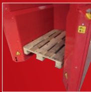
Reinforced inlet plates (+8 mm) + backplate (+1 mm)