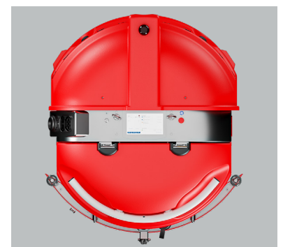
User-friendly control interface with remote access (via app and tablet)