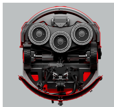
Reliable v-shaped brush layout