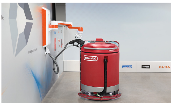
The fully automated docking station based on the charging assistant KUKA carla_connect

and an intuitive app. The control is in your hands, no matter where you are.